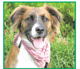
Molly April 2005 - February, 2019