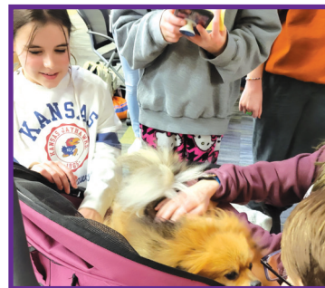
Tassi and Kikki