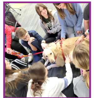
Ghost and Chisholm Trail Students