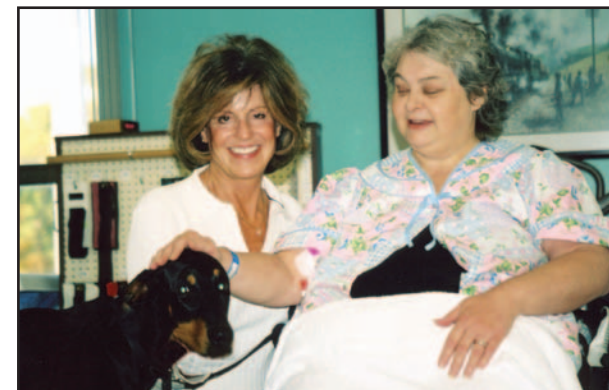
NORTH KANSAS CITY HOSPITAL

“Pets for Life is a ray of sunshine for patients, helping decrease depression.”